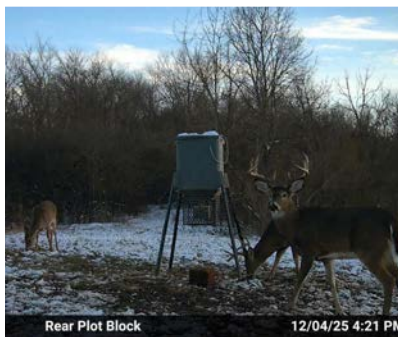
Rear Plot Block