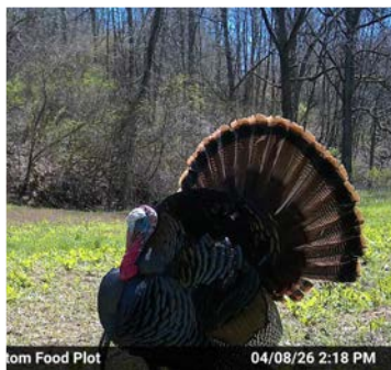
Tom Food Plot